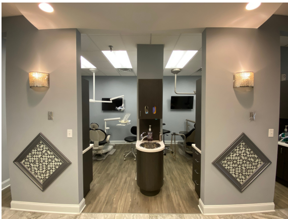
Take a Virtual Tour! www.LZdentist.com